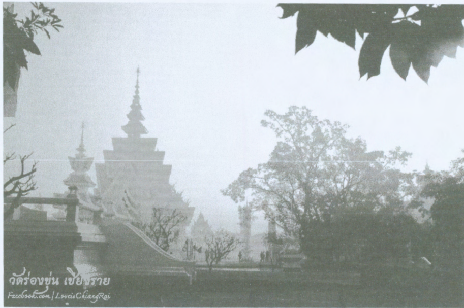
White Temple (Wat Rong Khun)