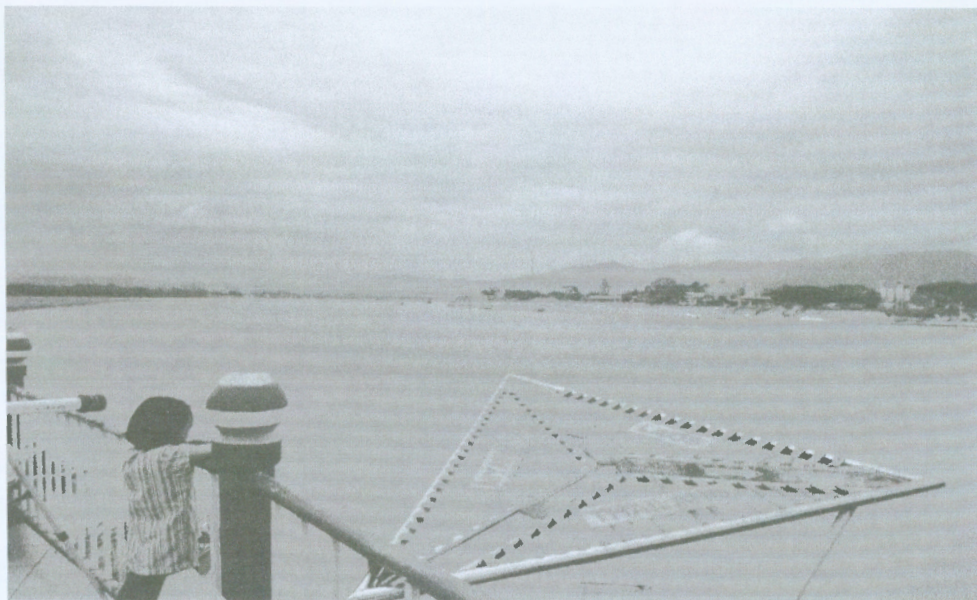
Golden Triangle and Mekong river